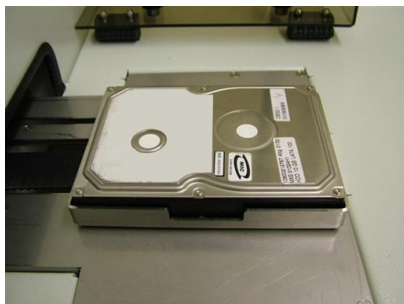
HDD inserted into caddy ready for erasure