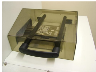
Media caddy cover in its closed position